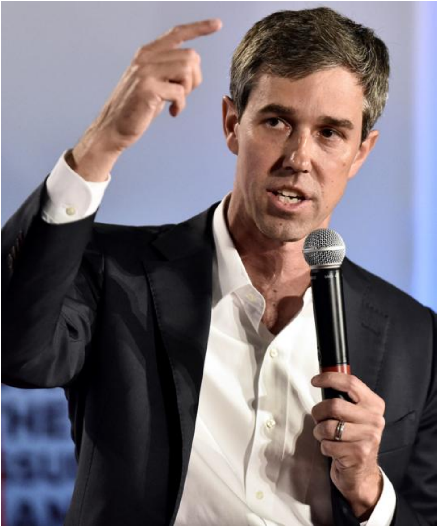
Rep. Beto O'Rourke, 2020 Democratic presidential hopeful in the forum.